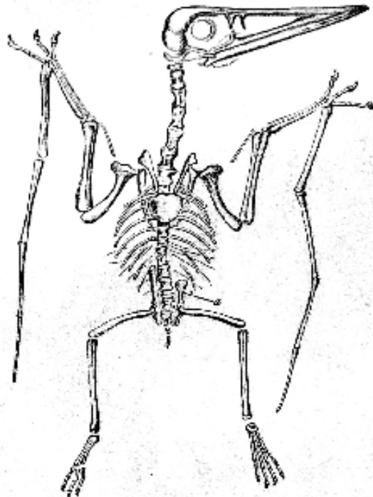
FIG. 4.—Skeleton of a short-tailed Flying Reptile ( Pterodactylus spiciferus ), from the Upper Jurassic (Lithographic Stone) of Eichstätt, Bavaria; nat. size. a. pubic bone. (Table-case 1.)

The latest Pterodactyls are the largest, and are best known by skeletons from the Chalk of Kansas. They are well illustrated by a fine pair of wings of Pteranodon , which are mounted on a picture of the complete skeleton in Wall-case 2 (Fig. 3). The outline and proportions of the bones painted in the picture are based partly on specimens in American museums, partly on the imperfect remains in Table-case D. The jaws form a sharp, toothless beak, and the head rises behind into a prominent crest. The breast-bone is short and broad with a keel in front; and the shoulder-blade on each side is firmly fixed to the backbone to strengthen the socket in which the wing works. The wing-fingers, of which the actual bones are shown, are immense, and the supposed extent of the membrane they originally supported is indicated in colour. The total expanse of the wings is about eighteen feet [5.5m], and it is thought that the principal muscle which rises them upwards had their origin in the crest at the back of the head [an interesting idea!]. Three diminutive fingers with conspicuous claws occur as mere splints grafted on the basal piece of each wing-finger. The hind legs are weak, and could scarcely have supported the whole weight of the animal when at rest or moving on the ground.