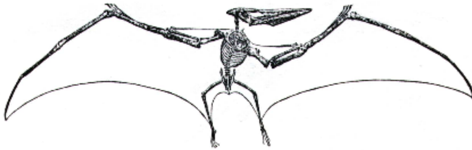
FIG. 3.—Skeleton of a toothless Flying Reptile ( Pteranodon occidentalis ), from the Upper Cretaceous of Kansas, U.S.A.; about one fifty-fourth nat. size. (Wall-case 2.)

The latest Pterodactyls are the largest, and are best known by skeletons from the Chalk of Kansas. They are well illustrated by a fine pair of wings of Pteranodon , which are mounted on a picture of the complete skeleton in Wall-case 2 (Fig. 3). The outline and proportions of the bones painted in the picture are based partly on specimens in American museums, partly on the imperfect remains in Table-case D. The jaws form a sharp, toothless beak, and the head rises behind into a prominent crest. The breast-bone is short and broad with a keel in front; and the shoulder-blade on each side is firmly fixed to the backbone to strengthen the socket in which the wing works. The wing-fingers, of which the actual bones are shown, are immense, and the supposed extent of the membrane they originally supported is indicated in colour. The total expanse of the wings is about eighteen feet [5.5m], and it is thought that the principal muscle which rises them upwards had their origin in the crest at the back of the head [an interesting idea!]. Three diminutive fingers with conspicuous claws occur as mere splints grafted on the basal piece of each wing-finger. The hind legs are weak, and could scarcely have supported the whole weight of the animal when at rest or moving on the ground.